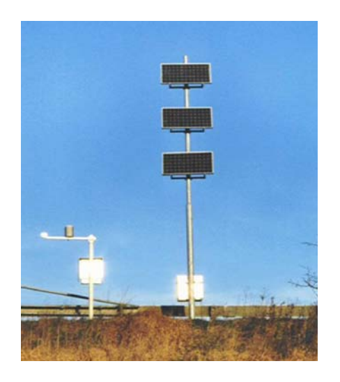
Fig. 5. Measuring station with solar cells and wireless transmission

In some areas, typically along motorways, there is no communication infrastructure, and there is any power supply. In these areas we establish measuring stations powered with solar cells and telecommunication via GPRS connections. In this situation the communication interface – AMPLEX is special designed for low power operation. This means that part of the facilities in the network has been disregarded to keep the power consumption at the lowest possible level. A measuring station powered with solar cells and wireless communication is shown in Figure 5.