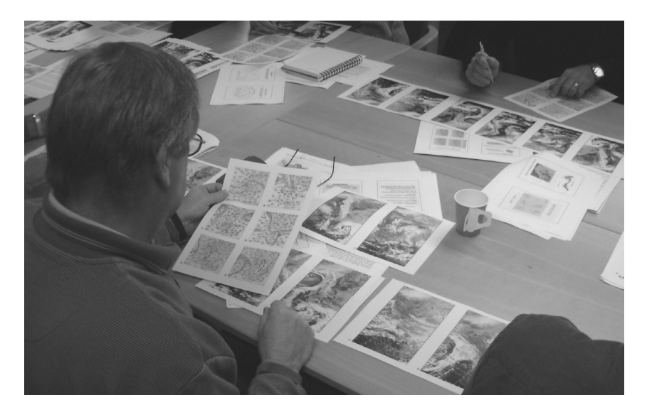
Figure 1. The photo shows how weather maps can be compared with satellite images.

As discussed earlier, one of the most important subjects to discuss with the municipal maintenance personnel is weather information and the tools available today. General weather maps and forecasts are widely available on TV, radio, daily papers and on the internet. The larger municipalities also buy local forecasts from SMHI. Even if this information is clear and easy to interpret, a person with some meteorological background can also understand the implications for road conditions. Satellite images are information that can be useful when following fronts etc. One exercise during the course is to compare satellite images and weather maps (figure 1). The exercise increases the understanding for how weather conditions are associated with different weather elements.