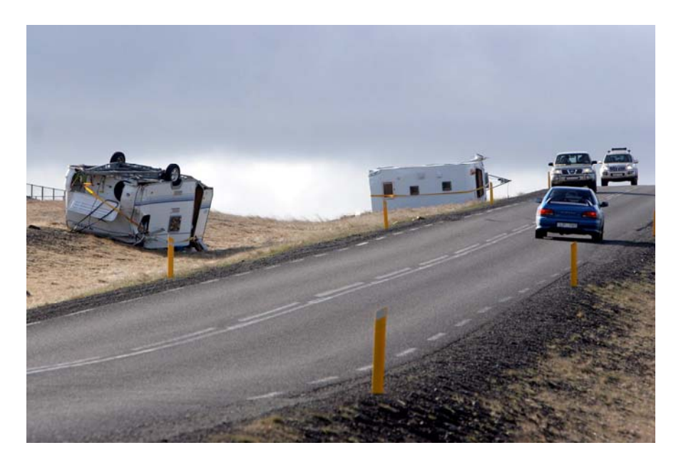
Figure 2. An example of collateral damage due to a violent wind gust in month of May.