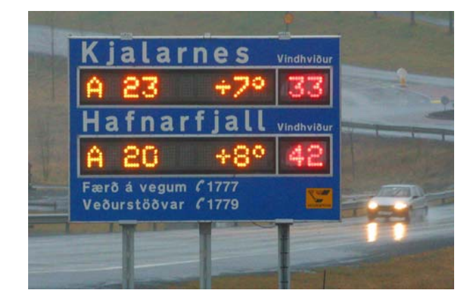
Figure 1. Backlit billboard for two nearby locations. Wind gusts are shown in red for measurements at least 15 m/s.

Strong wind gusts close to steep mountains are a threat to the safety of travellers on the Icelandic National Roads. Numerous events of strong wind gusts blowing vehicles off roads, and the collateral damage is considerable. Injuries have occurred in these events, as well as fatalities. The maximum wind gusts can easily exceed 50 m/s during these events. The Icelandic Road Administration has operated roadside anemometers in a few of these places for 10 til 15 years. Measured wind gusts (1 sec) along with average winds velocity are displayed on backlit billboards at some distance before travellers reach these locations. A map of 60 known places where vehicles have been blown off roads has been produced. Data series from the weather stations have been analysed and the occurrences of wind gusts (fg > 30 m/s) have been correlated with wind direction, wind velocity and temperature gradient at the 925 hPa and 850 hPa pressure levels via ECMWF ERA -Interim [1]. Based on this analysis a statistical model for the likelihood of wind gusts in 9 different locations in 1 hour time steps has been produced. Section 2 shows a wind gust map of Iceland, but in Section 3 the meteorological reasons for wind gusts in Iceland as well as the methods used to forecast the magnitude of wind gusts are discussed.