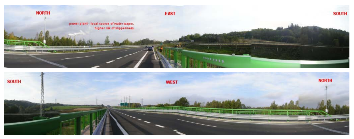
Figure 3. Left and right half of final panoramic image with legend.