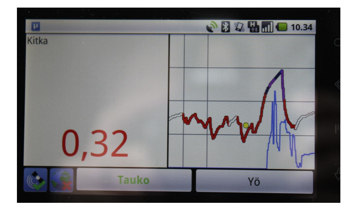
Figure 4. Android user interface of the RCM411 display in Huawei Ideos X5.

In Figure 4 there is a photograph of an Android user interface. The left half of the screen is reserved for the \mu TEC Friction Meter and the right half to the results of RCM411. Here also yellow spots correspond to the results of the \mu TEC Friction Meter and the last result is also shown as a number on the left side. The thin blue line is water layer thickness in millimetres. The first quarter of the scale from 0.00 to 0.25 mm is linear. Over the 0.25 mm line the scale continues so that doubling in the scale means fourfold of real value. Thus the level at 0.50 corresponds to 4 times 0.25, i.e. 1 mm of water layer or black ice and the top of the screen corresponds to 4.00 mm.