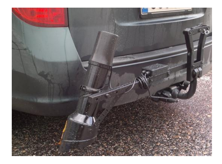
Figure 2. RCM411 installed to a passenger vehicle equipped with a 50 mm trailer ball joint.

The sensor cable connects to a small box on the sensor support arm. There is a BlueTooth module in the box to communicate the measured data to a user interface inside the car. The other cable going to the same box delivers power from the trailer connector to the BlueTooth module and the sensor. A standard user interface of RCM411 is a cell phone either with a Symbian S60 or an Android operating system.