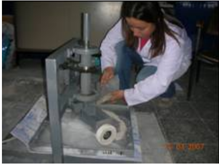
Figure 3. Materials preparation

In Turkish Highways, 360 kg abrasive material is spread per kilometer under snow conditions. Because of this, 60 g abrasive material was used for the 48x48 cm<sup>2</sup> tray for testing in adapting the real conditions to testing conditions. After the tray is put into the equipment, abrasive material specimen is sprinkled on the icing surface where the wheels are passed (Figure 3). After the abrasive material is sprinkled, the test is started and continued for 10 minutes duration (Figure 4).