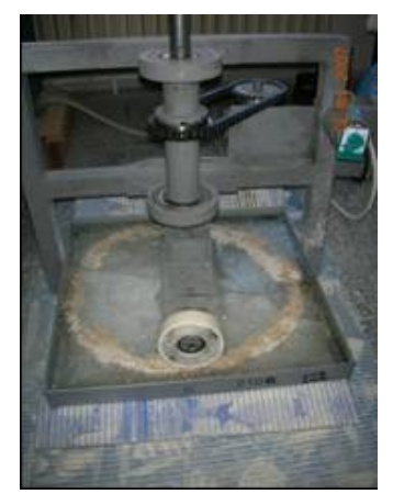
Figure 4. Test equipment application