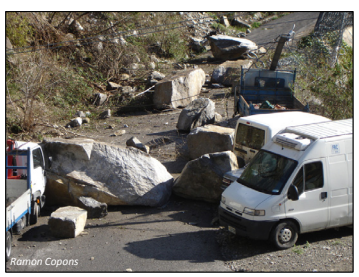
Figure 2. Episodes of natural hazards that have caused fatalities on Andorran roads from 1933 to the year 2000