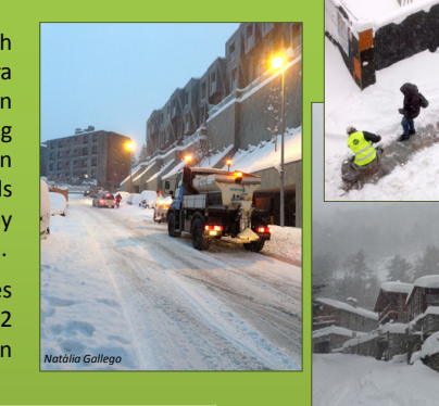
Figure 4. Some images of the snowfalls and cleaning tasks of the 2012-13 winter

Throughout the winter season 2012-13, in Sorteny and Bony de les Neres weather stations were recorded up to 58 days of precipitation higher than 2 mm (table 2) and snow depths in the ski resorts were very important: 6 m in Pal and Arinsal, 8.5 m in Grandvalira and 9 m in Arcalís (figure 5).